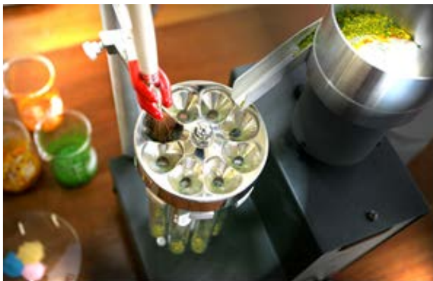
Figure 2: Spinning riffler

receivers at a constant rate causing them to be filled uniformly. The drawback to this method is that the sample volume is relatively small, handling powders in grams and milligrams.